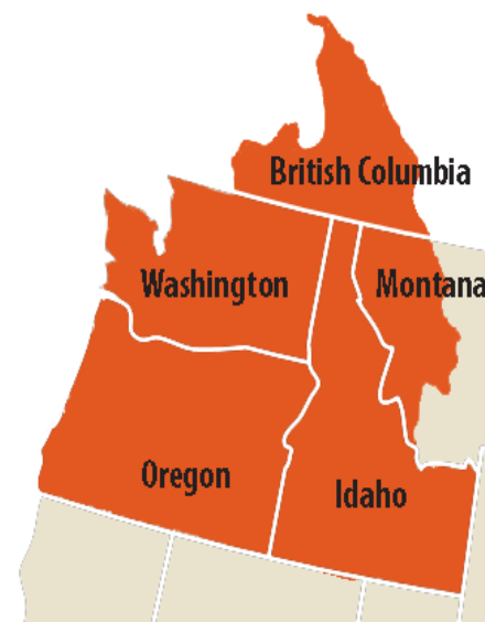
PNW DEWS Region